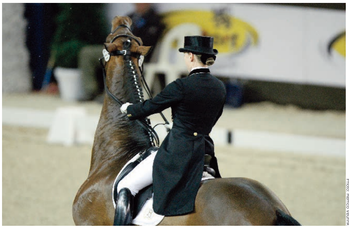
Good guidance after the sale is key to preventing this from occuring.

It could be expected that cases such as this one only occur in the sales of horses in the lower price ranges. The opposite is often true, however. Especially in the higher price ranges (upwards of €200,000), talented and often very experienced dressage and show jumping horses are sold abroad. When the sale is not conducted by a professional or a very experienced amateur, mismatches seem to occur very quickly. When the new rider is not quickly able to continue the horse's training at the same level as the selling rider rode at, the new rider will encounter all kinds of problems. Only very rarely does the new rider wonder if they may be the cause of